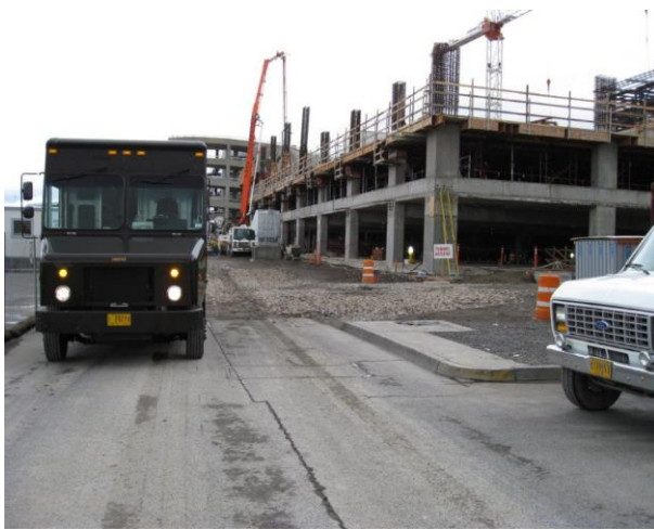
Structural Work at the Portland Airport, Oregon