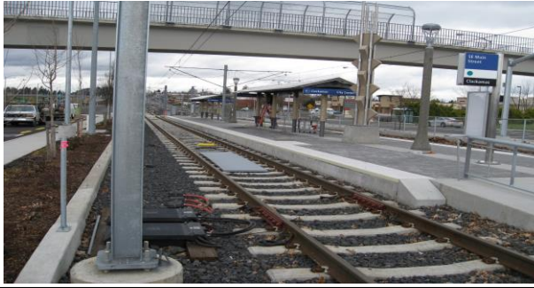
Light Rail Work in Portland, Oregon